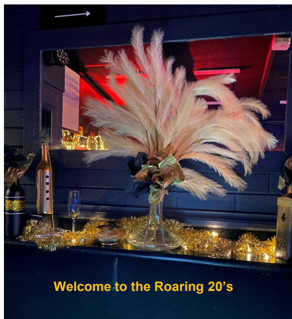
Welcome to the Roaring 20's