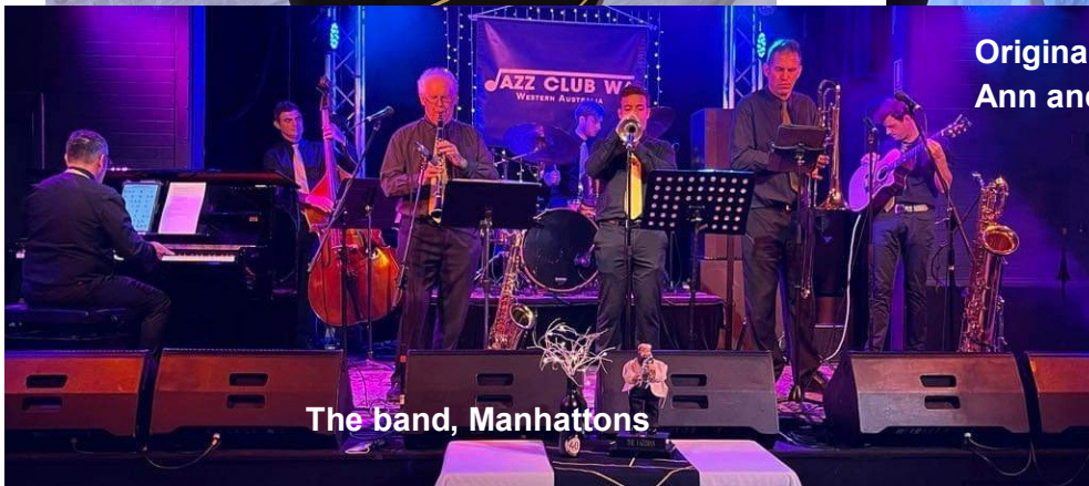
The band, Manhattans