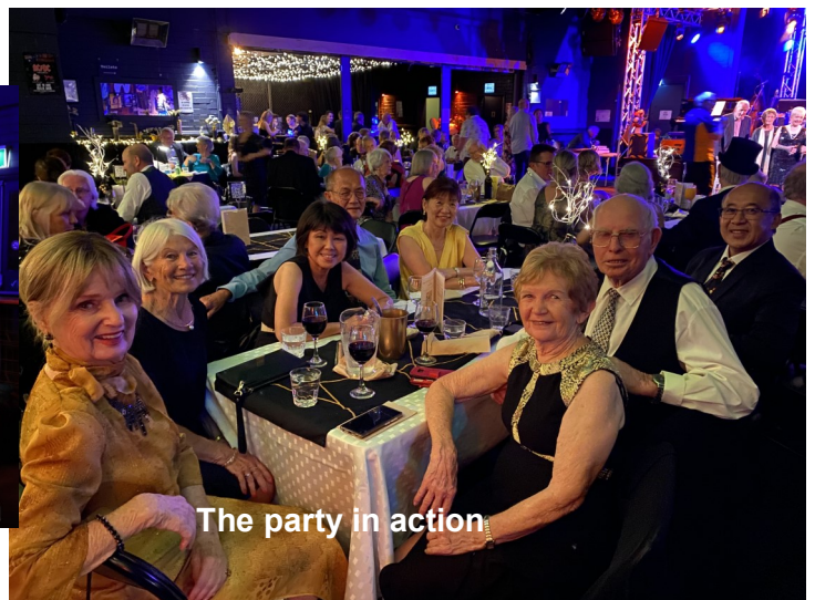
The party in action