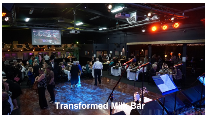
Transformed Milk Bar