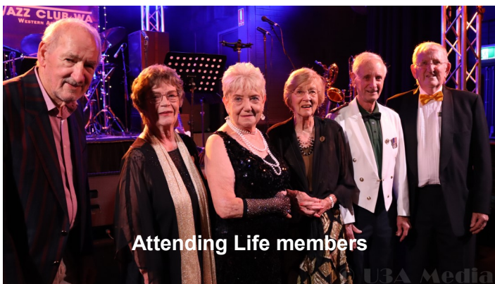
Attending Life members