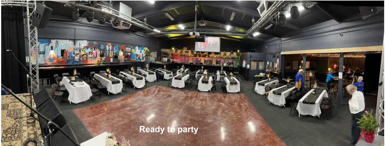
Ready to party